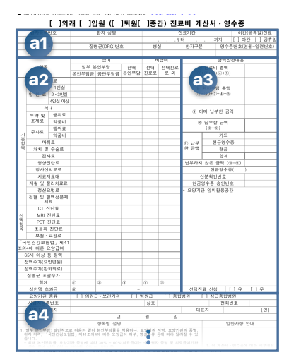
Figure 1: The standard invoice template consists of 4 different subtables: a1) Header with personal information, a2) Mid-left with price details, a3) Mid-right with a summary of the mid-left table, a4) Footer with hospital information and manual.

Every recognition result should be checked by staff as no errors are tolerated due to the nature of the task; The invoice contains information about the amount of money the company has to pay. Simply adding one more zero digits at the end of the amount can cause a big loss to the company. Currently, the company was using a custom spreadsheet format to manage the data extracted from invoice images. Due to the variations of Korean medical invoices, about 10% of the entries were missing and being accumulated in the "Other than Standard Items" field. For smartphone pictures of invoices that do not have initial recognition results, staffs enter all entries in the spreadsheet by typing manually and calculate the sum of non-standard price items. This is a very time-consuming and errorprone way of working. When the authors replicated the procedure to make ground truths of our dataset, it took three or more minutes on average to handle a single invoice image.