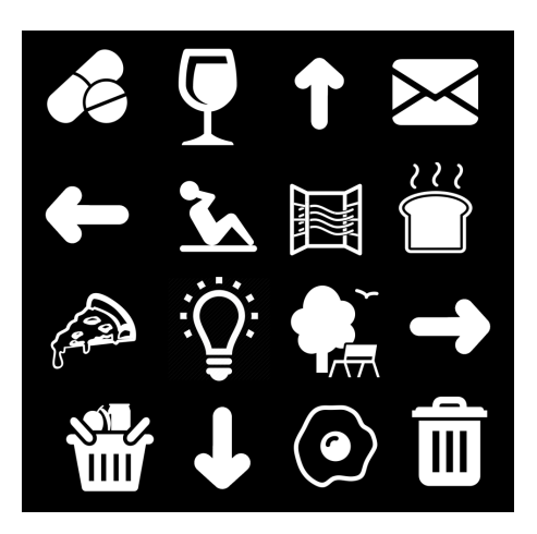
Figure 2: The grid of the P300 speller that is shown to the LIS patient.

On the proxy side, we used AR glasses to display selected items. We implemented our application for the Microsoft HoloLens, using the Unity engine as a platform. The speller already integrates a network interface which was used to send the selected elements to the proxy. The application receives the message and is able to display the selected item that is then sent via TCP to the HoloLens application. Those actions are then shown to the proxy in the form of a three-dimensional arrow object or as an icon. This object is displayed in the wearer's field of view for three seconds, every time an element is sent.